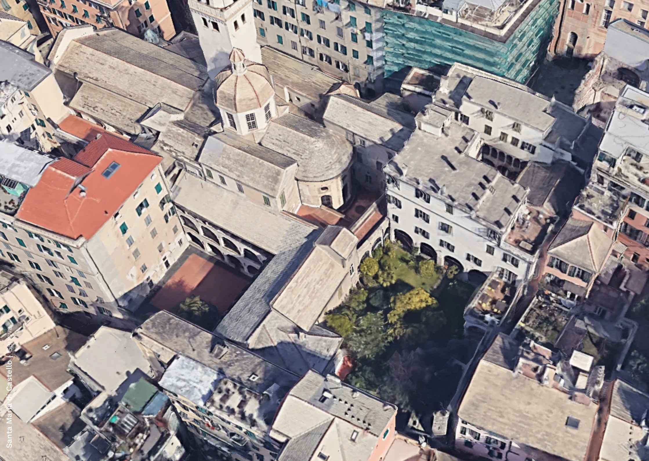
Santa Maria di Castello | Genova